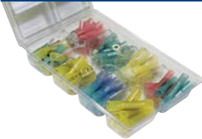
Heat Shrink Crimp Seal Terminal Kit Large assortment of rings, spades, disconnects and butt connectors, all right at your fingertips. Translucent, adhesive-lined polyolefin tubing allows visual inspection, prevents wire corrosion and provides a waterproof seal.