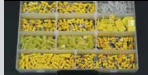
Ultimate Installer Box | Drawer 3

Every drawer is organized to make finding the right part quick and easy.