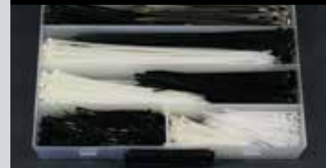
Ultimate Installer Box | Drawer 5

Every drawer is removable for portability.