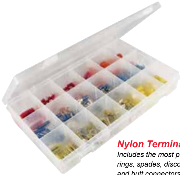
Nylon Terminal Kit Includes the most popular rings, spades, disconnects and butt connectors.