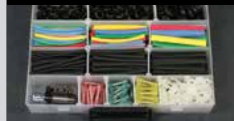
Ultimate Installer Box | Drawer 4

Every drawer is organized to make finding the right part quick and easy.