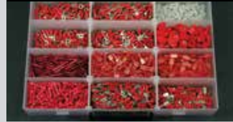
Ultimate Installer Box | Drawer 1